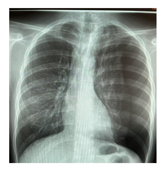
Picture 2. Left sided partial pneumothorax in an adolescent with pulmonary tuberculosis

Three months later, our adolescent patient complained of sudden severe left sided thoracal pain. Chest X ray revealed partial left sided pneumothorax. She was referred to regional hospital, received underwater drainage under surgical supervision. After 6 days her left lung expanded completely. (Picture 2)