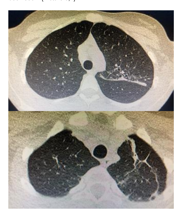
Picture 3,4. MSCT after 8 months of antituberculotic therapy, fibrotic lesions and cystic bronchiectasis Slike 3,4. MSCT nakon 8 meseci lečenja antituberkuloticima, fibrozne promene i cistične bronhiektazije viđene

Sputum sample was negative on direct microscopy. MSCT performed, fibrotic lesions and cystic bronchiectasis had been seen. (Picture 3,4).